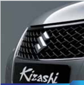
Sporty and Refined Front Grille

In the Kizashi, performance is only half the story. In equal measure, the Kizashi is luxurious and beautifully crafted to expand your view of what a sedan should be. In every control you touch. On every beautiful surface upon which you gaze. In the pristine quiet of a sensuous cabin. You'll experience craftsmanship and styling that inspire greater passion for living.