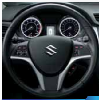
Steering Wheel Mounted Controls

The new Kizashi takes things in a new direction. It is a sedan designed precisely to alter your perception of performance, comfort and luxury. From its sleek European exterior and continental interior styling to its Japanese engineering and craftsmanship, the Kizashi is truly the best in its class.