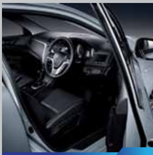
Interior Comfort and Luxury

From the moment you settle into the Kizashi's 10 way power-adjustable driver's seat, you find your senses completely engaged. At a glance you'll find that all the controls are positioned where you intuitively expect to find them. Every colour and contour you notice is subdued and refined, and the symmetrical design of the instrument panels only adds to your visual experience. Beautifully crafted from top to bottom, the Kizashi will truly alter your perception of driving.