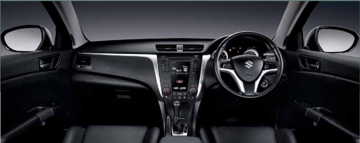
Modern and Sporty Interior

Any way you look at it, the Kizashi is simply beautiful. Aesthetically pleasing to the eye with its aerodynamic design and clean lines, it is sporty, stylish and bold at the same time. Look even closer, and you'll notice the attention to detail that befits a luxury car.