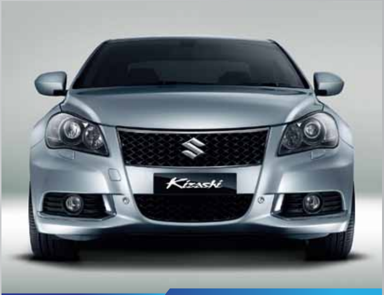
Aesthetically and Functionally Pleasing