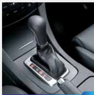
Continuously Variable Transmission (CVT)