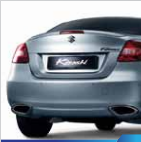
Aerodynamic Boot-lid Spoiler