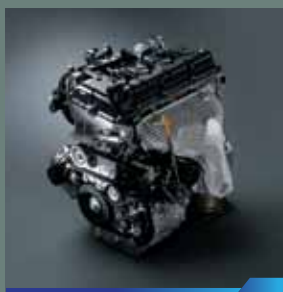
State-of-the-art 2.4-litre Engine