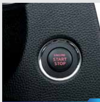
Keyless Push Start System