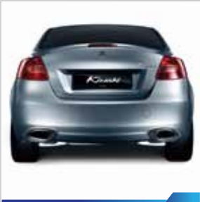
Stainless-steel Exhaust Covers